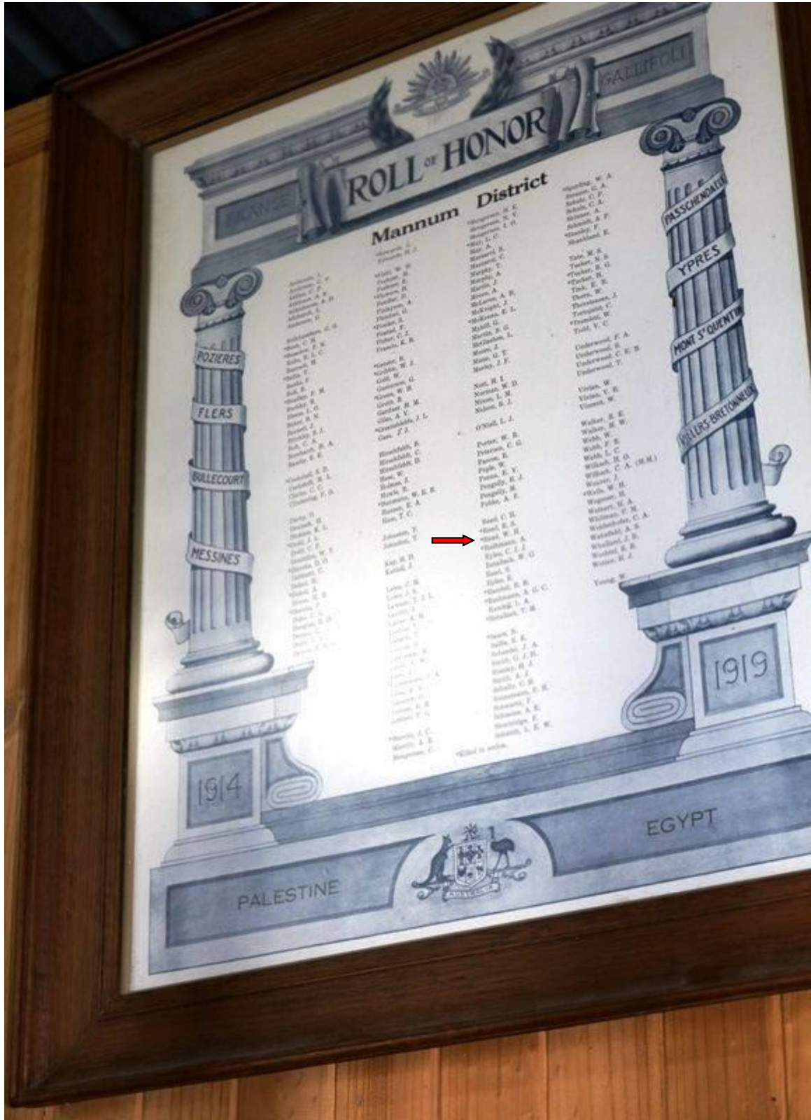
Mannum District Roll of Honour