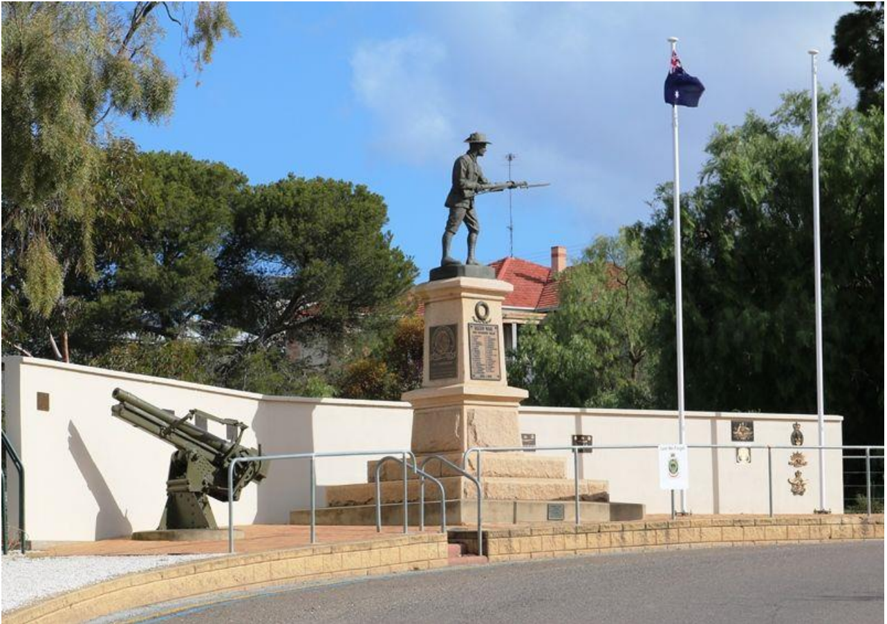
Mannum War Memorial